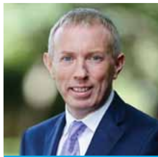
Deputy Timmy Dooley TD