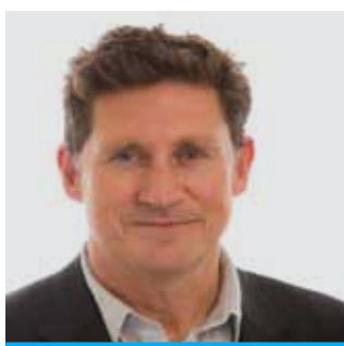
Deputy Eamon Ryan TD, Leader, Green Party