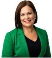
MARY LOU MCDONALD TD LEADER SINN FÉIN AND TEACHTA DÁLA